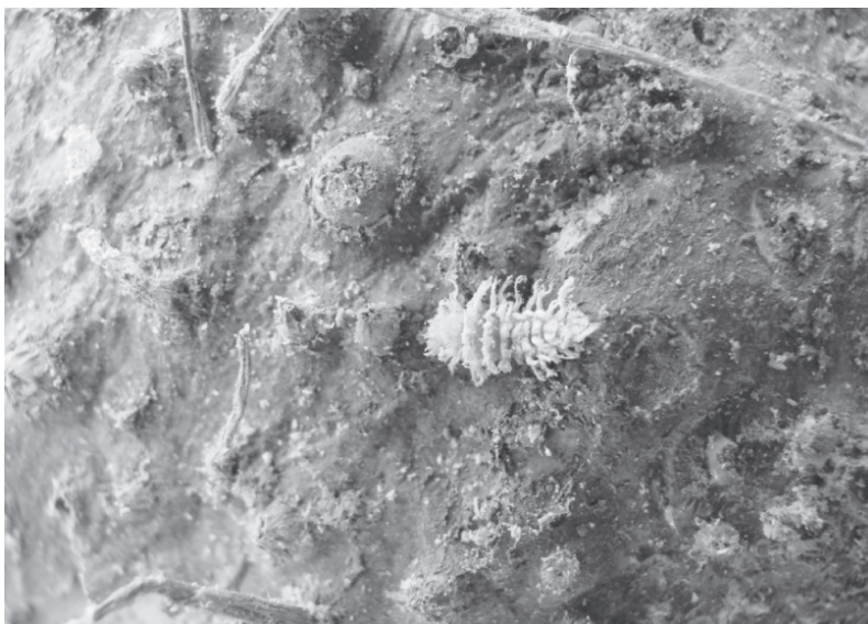
Fig. 2. Cryptolaemus larvae

The longevity of female beetle was approximately 2 months and laid 10 eggs per day directly into the cottony egg sack of the adult female mealybugs. The fecundity was on an average 500 \pm 18 . Adult beetles and young larvae feed on mealybug eggs and young stages. Cryptolaemus larvae were also found preying on adult mealybugs. The life cycle ranged between 4 to 7 weeks depending on temperature. Incubation period was 5 days at 27^{\circ}\text{C} and the three larval stages lasted for 12 to 17 days, during which, the larvae feed on mealybug eggs, young crawlers