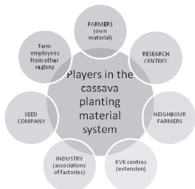
Fig.2. Cassava planting material system's actors in the industrial area of Tamil Nadu

The most common way to source cassava planting material in Tamil Nadu is to re-use the cassava stems from their own fields. In fact, cassava is a crop that has been planted in the region for over four generations. Thus, every year, farmers gather some cassava stems which they store for the next planting season. From time to time, farmers exchange planting material, to try new variety and/or to regenerate their own material. This happens only if there is trust among the neighboring farmers, and if costs are not too high to reach the other farmer's field.