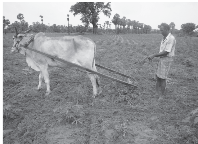
Fig. 1. Seven tynes 'Gorru'