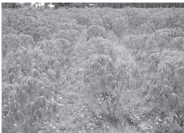
Fig. 2. Five days after glyphosate applied cassava field

In Tamil Nadu, farmers apply glyphosate (6-8 ml l -1 water) through hand sprayer during the initial crop growth period (1-1.5 months) to control weeds when cassava is a sole crop. When cassava is intercropped with onion, oxadiazon (2 ml l -1 water) or pendimethalin (8 ml l -1 water) is power sprayed within 3 days after planting cassava and onion to control emerging weeds. During survey, we observed that in Andhra Pradesh, farmers preferred paraquat (2-3 ml l -1 water) during 1-2 months after planting and glyphosate (4-5 ml l -1 water) 3-5 months after planting to control weeds (Fig. 2). Pre-emergence application of oxyflourfen, pendimethalin,